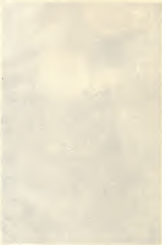
The Vision of Echard